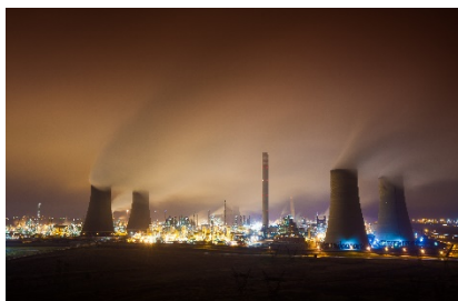
Sasol Refinery Secunda Customer: Sasol