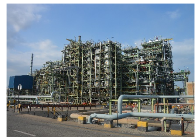
Sasolburg Operations Sasolburg Customer: Sasol