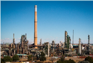
Natref Refinery Sasolburg Customer: Natref