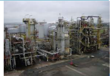
SAPREF Refinery Durban Customer: Shell & BP